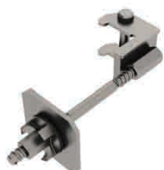
VINC'I 70 MULTI PANEL LOCK