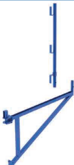
BD-K 100 VY