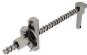
VINC'I 70 SPANNER ELEMENT