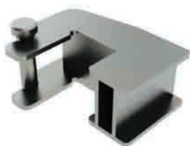
VINC'I 70 SPANNER BRACKET