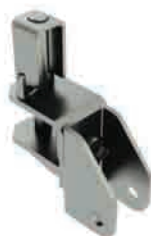
PROP HEAD PLATE (Vinc'i 70 Type)