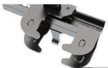
VINC'I PANEL LOCK "TU-T 70"