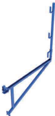
BD-K 80 VY